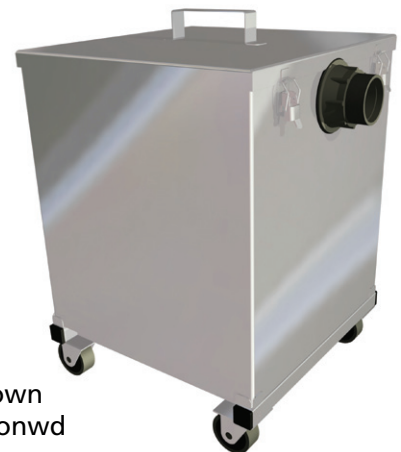
Unit Shown Fully Optionwd